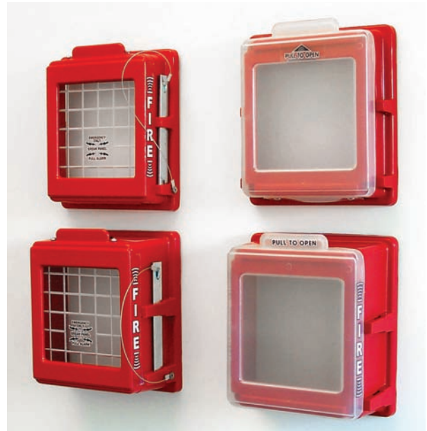
Top Row: Flush Mounted / Bottom Row: Surface Mounted Left Column: Break Panel / Right Column: Pull Door

Break Glass model shown above. NOTE: Dimensions are same for Pull Door models. All mounting screws are concealed.